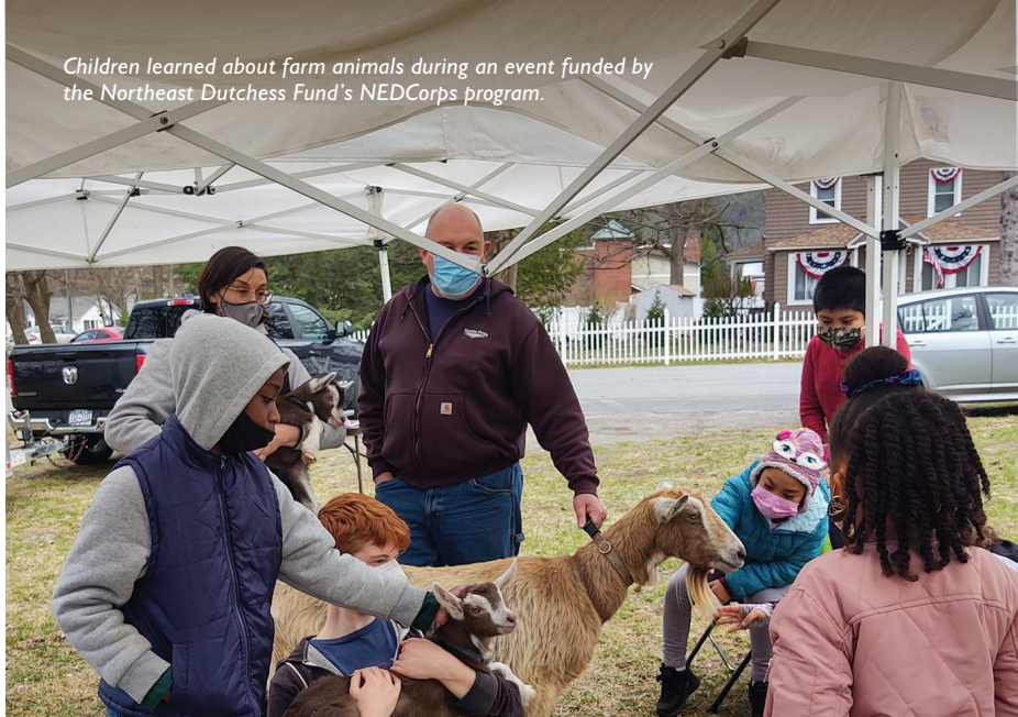
Children learned about farm animals during an event funded by the Northeast Dutchess Fund's NEDCorps program.

“There are resources available in our communities.