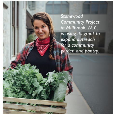
Stonewood Community Project in Millbrook, N.Y., is using its grant to expand outreach for a community garden and pantry.