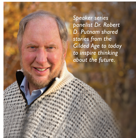
Speaker series panelist Dr. Robert D. Putnam shared stories from the Gilded Age to today to inspire thinking about the future.