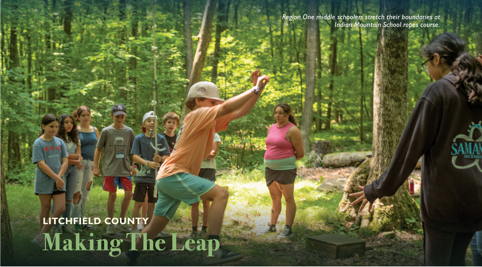
Region One middle schoolers stretch their boundaries at Indian Mountain School ropes course.

2023 marked the second successful season of Region One’s summer enrichment program for middle schoolers. With funding already secured for its 2024 season, this transformative initiative has been officially named the “Summer Mountaineer Experience.”